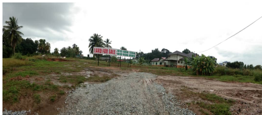
FIGURE 4. Recommended purposed site