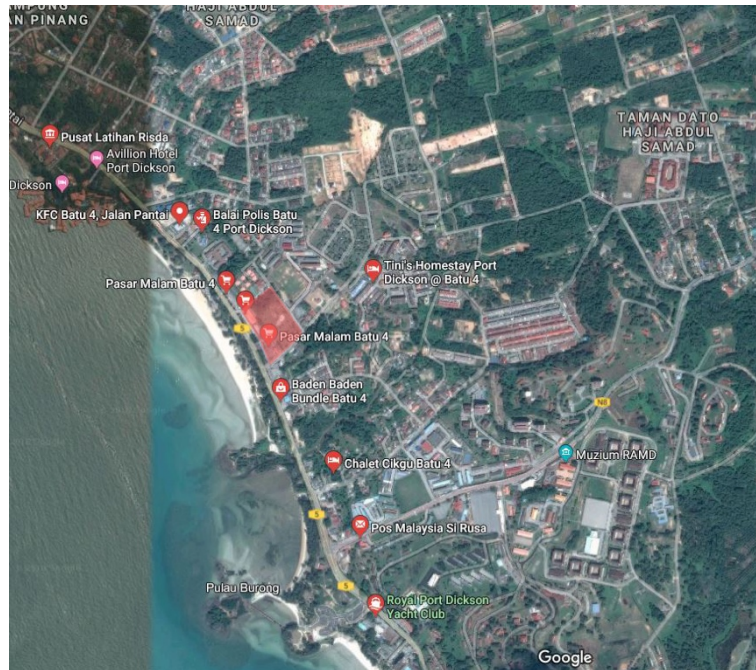
FIGURE 3. Existing Pasar Malam Batu 4