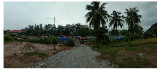
FIGURE 5. View from the purposed site