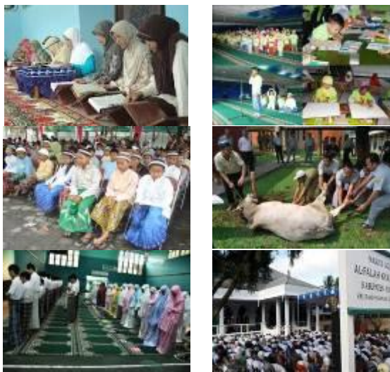
Figure.4. The mosque space utilization with adaptability of common activities [9]

be saved with the functioning of space for different activities. In general, time management use of space in the mosque has been done wisely by the people / worshipers, resulting in the utilization of space for the activities of pilgrims adults (men / women) can be adapted to the needs and capacities, as well as to the activities of children in learning read the Koran and special events on the big day Islam. The outdoor space / exterior is also used to adjust the capacity of the living space on several activities festivities, either to pray in the courtyard mosque (prayer-Eid), the event Eid al-Qurban, as well as other social activities such as mass circumcision, wedding receptions, Tabligh Akbar etc. Some of the considerations that can be done in the planning of these spaces are adjusted to the needs and the availability of existing land resources.