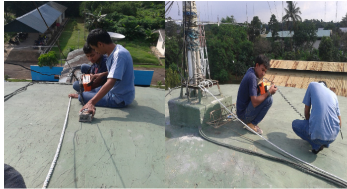
Figure 3: Profometer Testing