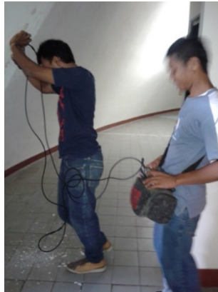
Figure 1: UPV test

Ultrasonic pulse velocity (UPV) test is intended for observing the uniformity of existing concrete and existency of cracks. Indirect method was applied (Fig.1) The UPV test were carried out at five location to observe dome concrete crack region.