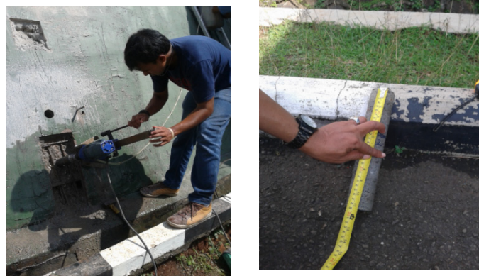
Figure 2: Core Drilling

Core drilling (Fig.2.) is intended for obtaining specimen out of existing concrete was before test in laboratory to find compression strength of concrete. The size of specimen cylinder is 200 mm height and 100 mm diameter. Coring is performed along the dome around 8 points with a height variation of 50 mm and 100 mm from the dome base.