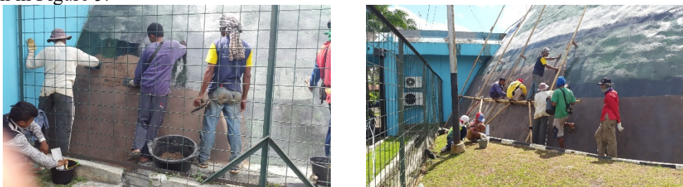
Figure 5: Instalment of CFRP to Strengthening Dome

Based on the safety factor, therefore, 3,8m was attached. The installment of the repairment is shown in Figure 5.